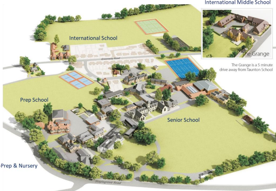
International Middle School