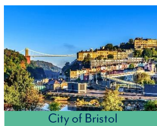
City of Bristol