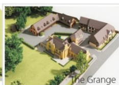
The Grange is a 5 minute drive away from Taunton School