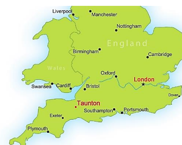
1 Hour 40 minutes by train from London