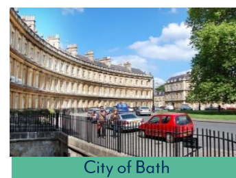
City of Bath