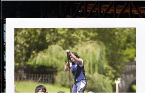
Punting in Cambridge